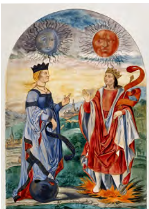
The Queen and King, representing two alchemical principles (from Salomon Trismosin: Splendor Solis , 1582)

psychological processes involved as the base matter of the horoscope becomes alchemical gold. We will compare the major alchemical stages with planetary transits, working on our own charts to identify and engage with the different stages on the journey towards the mystical marriage, the goal of the alchemical opus.