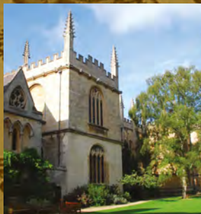
Exeter is one of Oxford's oldest colleges, and located at the heart of the city