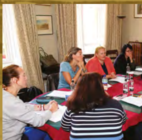
Chart Interpretation Courses

These courses are designed to build skills and confidence in chart interpretation in a supported learning environment.